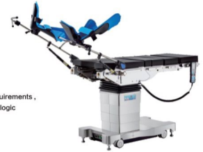
Optional Position Mattress, Leg Support,Waste Basin